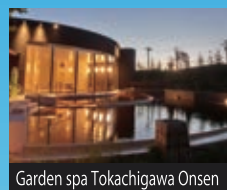
Garden spa Tokachigawa Onsen