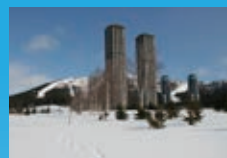
Hoshino Resort Tomamu